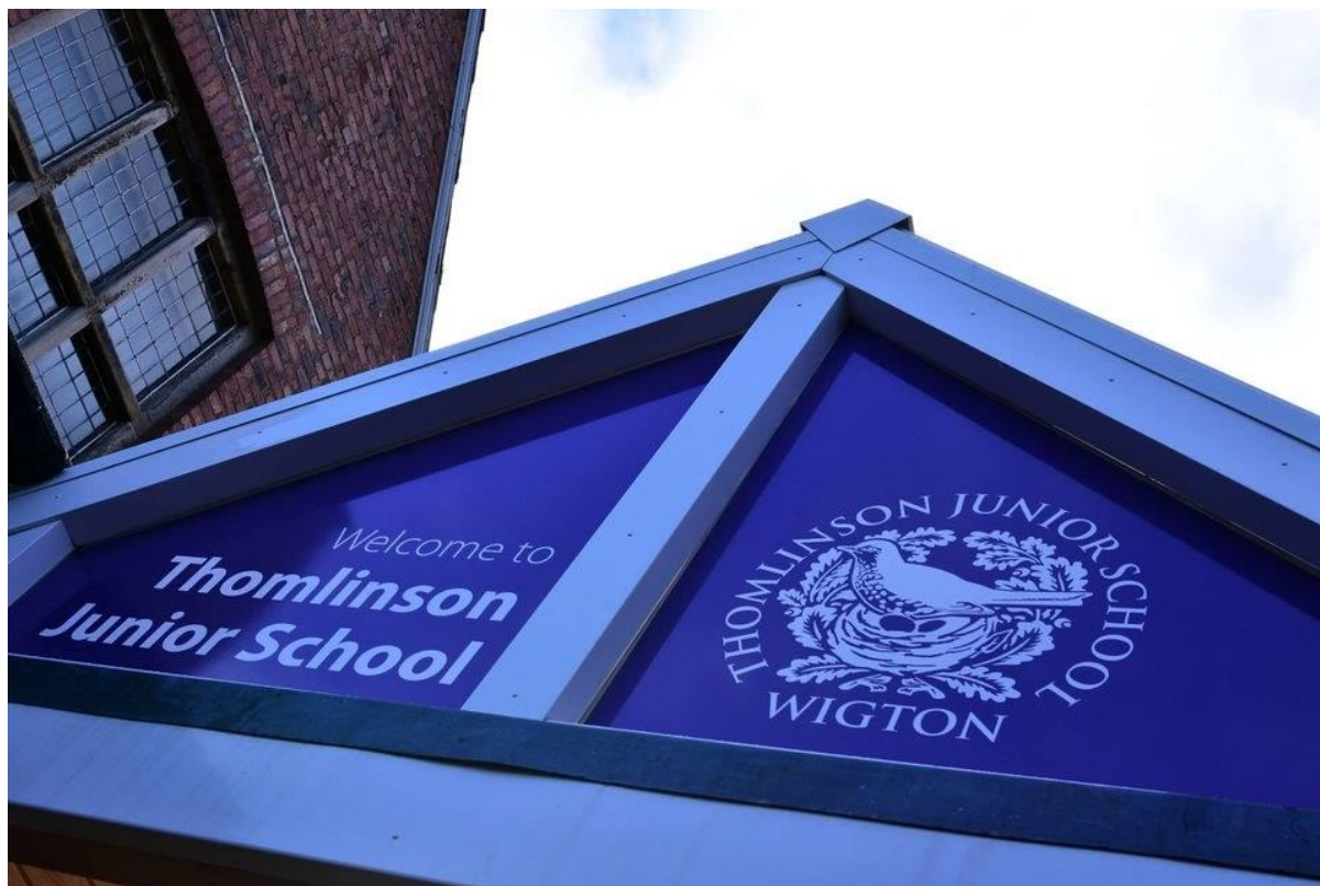
Thomlinson Junior School