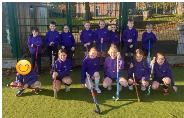
Year 3/4 Carlisle Schools' Hockey