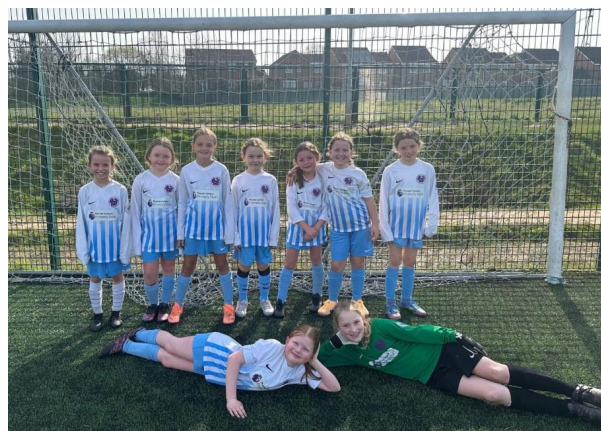
Year 3/4 Carlisle Schools' Girls' Football